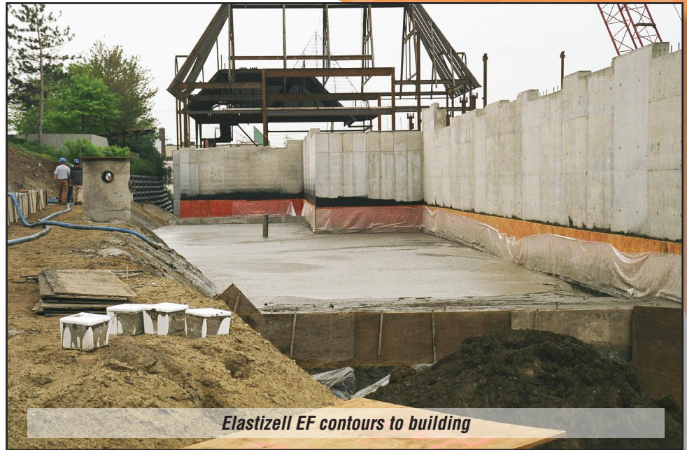
Elastizell EF contours to building