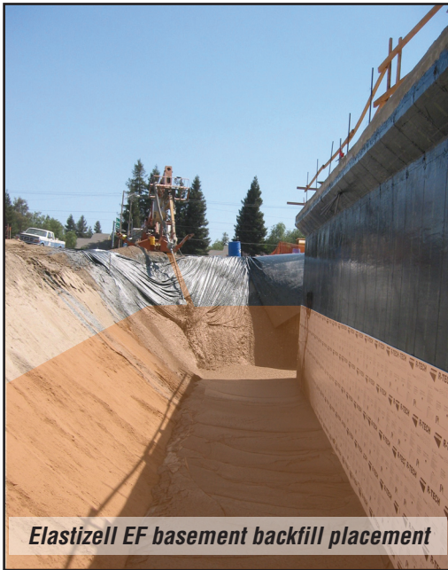
Elastizell EF basement backfill placement